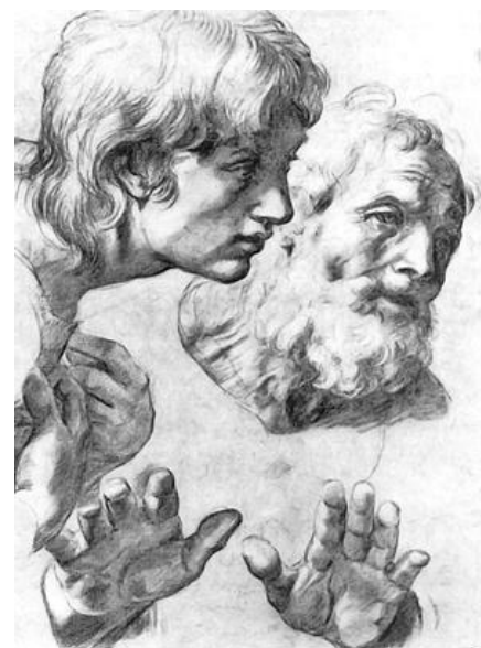
Study of the Heads and Hands of Apostles by Raphael

From him the whole body, joined and held together by every supporting ligament, grows and builds itself up in love, as each part does its work.