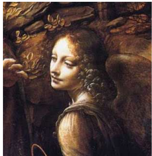
The Angel in “The Virgin of the Rocks”, Leonardo da Vinci